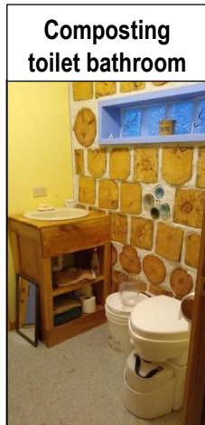
Composting toilet bathroom