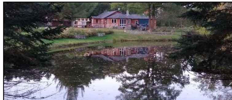
Main residence on the pond. Meals can be with residents, or cook your own outside by the cabin.