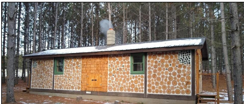
Cordwood Cabin – 2 units, shared bathroom – composting toilet & wash station