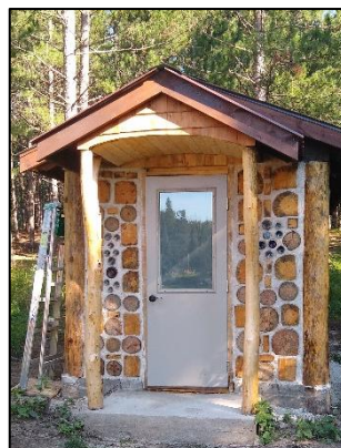
Cordwood Sauna & Shower