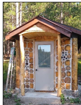
Cordwood Sauna & Shower