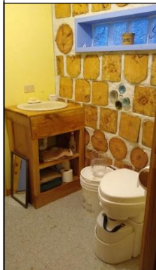
Composting toilet bathroom