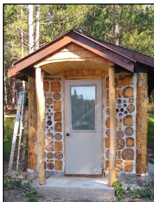
Cordwood Sauna & Shower